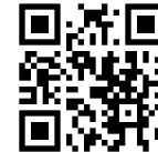
Link to our website for more information