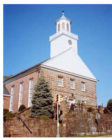
The Connecticut Farms Church