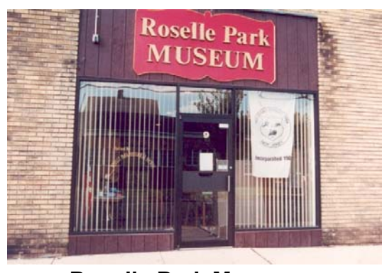
Roselle Park Museum