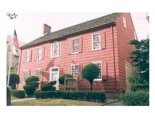
Boxwood Hall State Historic Site