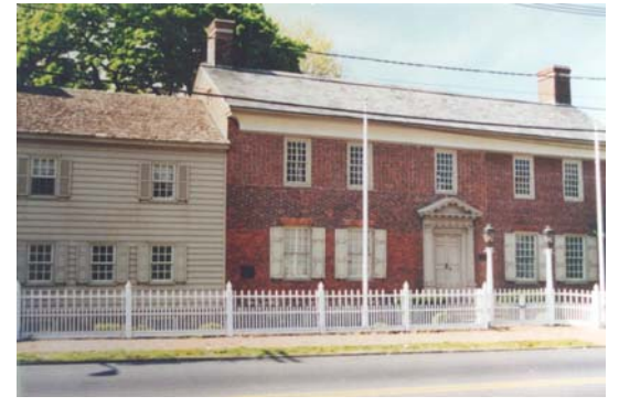
Nathaniel Bonnell Homestead & Belcher-Ogden Mansion