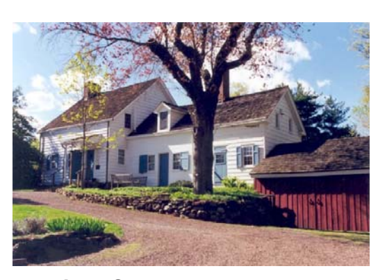
Miller-Cory House Museum