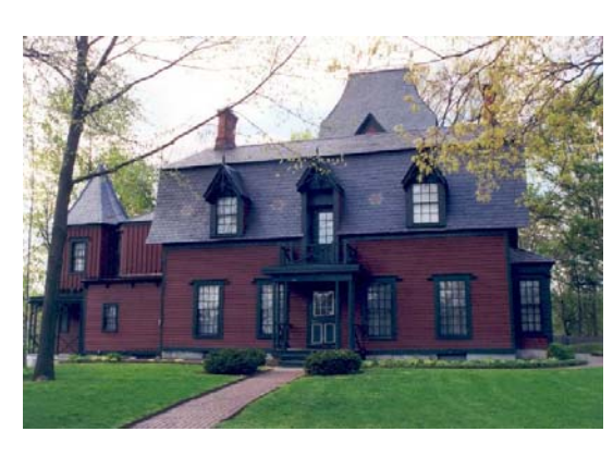
Drake House Museum