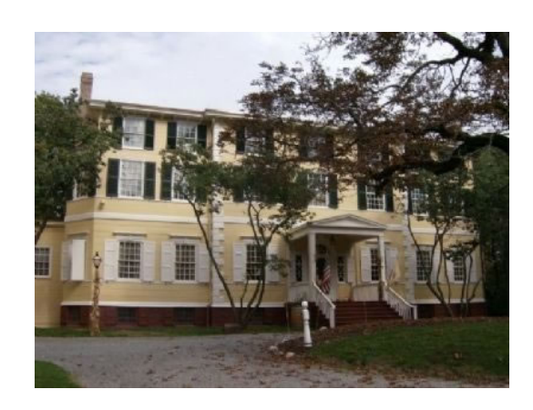
Liberty Hall Museum