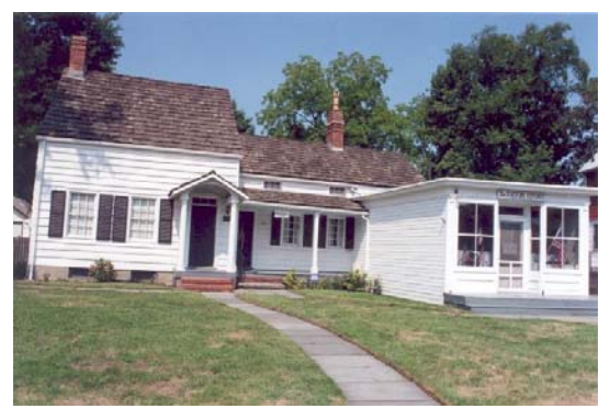
Woodruff House Eaton Store Museum