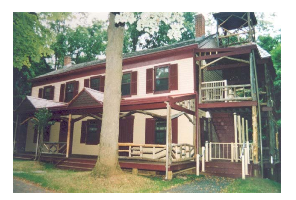
Deserted Village of Feltville-Glenside Park