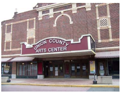
Union County Performing Arts Center