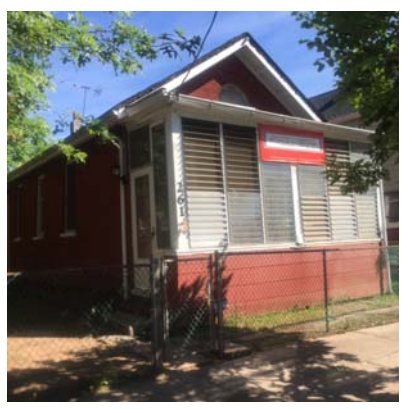
Rahway School for Colored Children and the African American History & Heritage Center