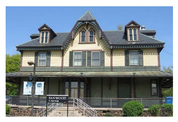
Historic Fanwood Train Station