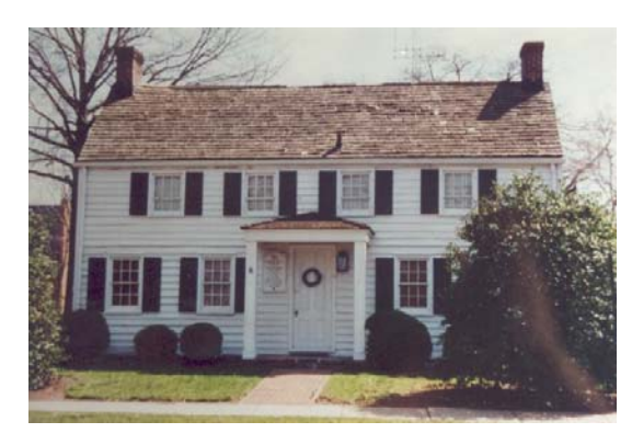
Osborn Cannonball House