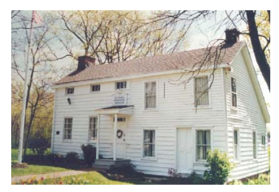
Salt Box Museum