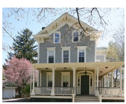
Reeve History & Cultural Resource Center