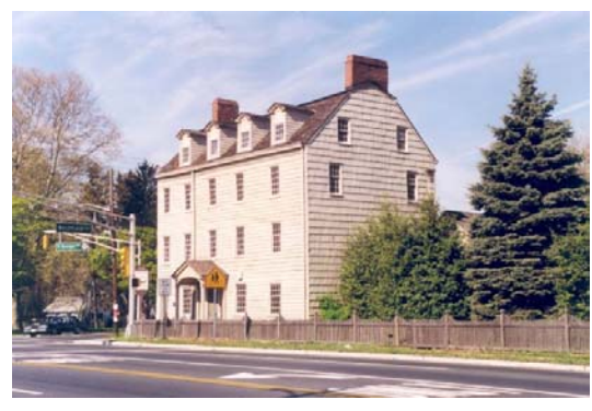
Merchants and Drovers Tavern