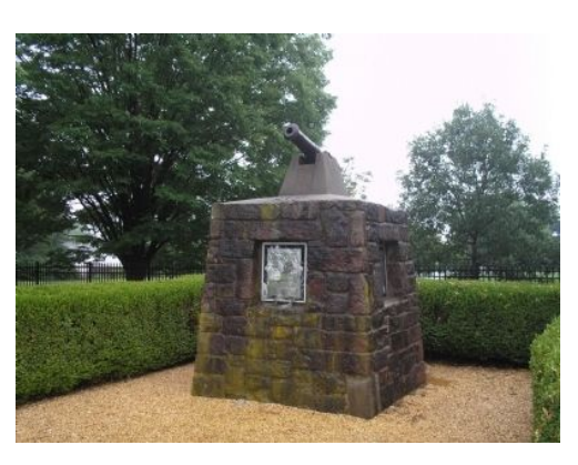
Ash Brook Reservation