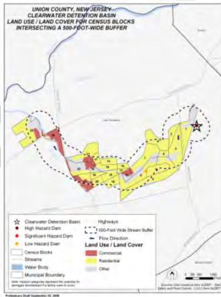
Figure 10-2 Clearwater Detention Dam Land Use/Land Cover for Census Blocks Intersecting a 500 Foot-Wide Buffer

Figure 10-2 is map of Clearwater Detention Dam located along the Salt Brook in New Providence Borough. As indicated in the County Section of the Plan, Clearwater Detention Dam is listed as one of the three high hazard dams. The map identifies the land use/land cover for the census blocks intersecting a 500- foot-wide stream buffer.