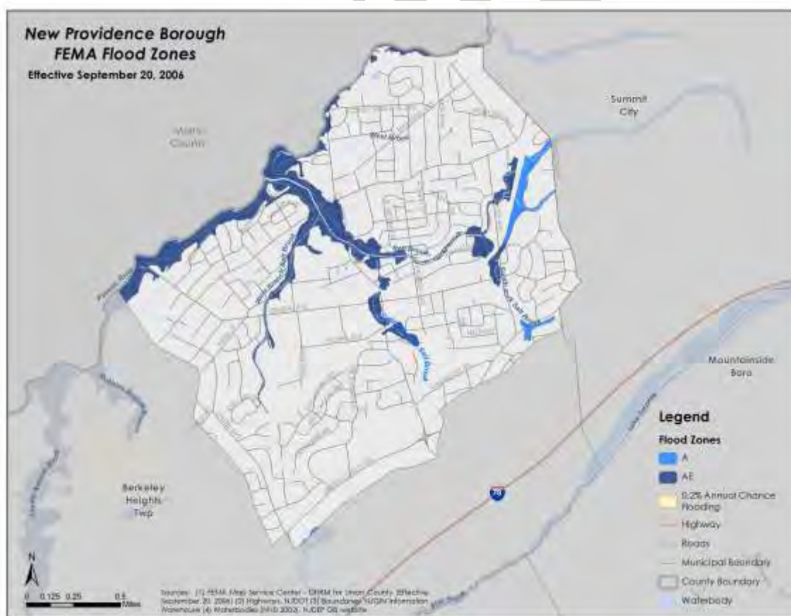
Figure 10-3 Borough of New Providence Effective FIRM

As discussed elsewhere, flood impacts in the New Providence Borough are not significant compared to other jurisdictions in Union County. Usually these impacts are limited to flooding of structures (especially basements) and roads. There is no significant history of flood damage to critical facilities or populations in the jurisdiction. As expected, the most frequent and serious damages appear to be related to structures that are well within the boundaries of the floodplain, i.e. close to the stream or river center line, particularly along the Passaic River. . As shown in Figure X-X, this community has numerous NFIP repetitive loss properties, distributed across most areas of floodplain. A basic review of NFIP claims for New Providence Borough shows a wide range of claims dates, with some concentrations related to the remnants of Hurricane Floyd in 1999, and Irene in 2011. The main County HMP includes more information about events that have impacted this area.