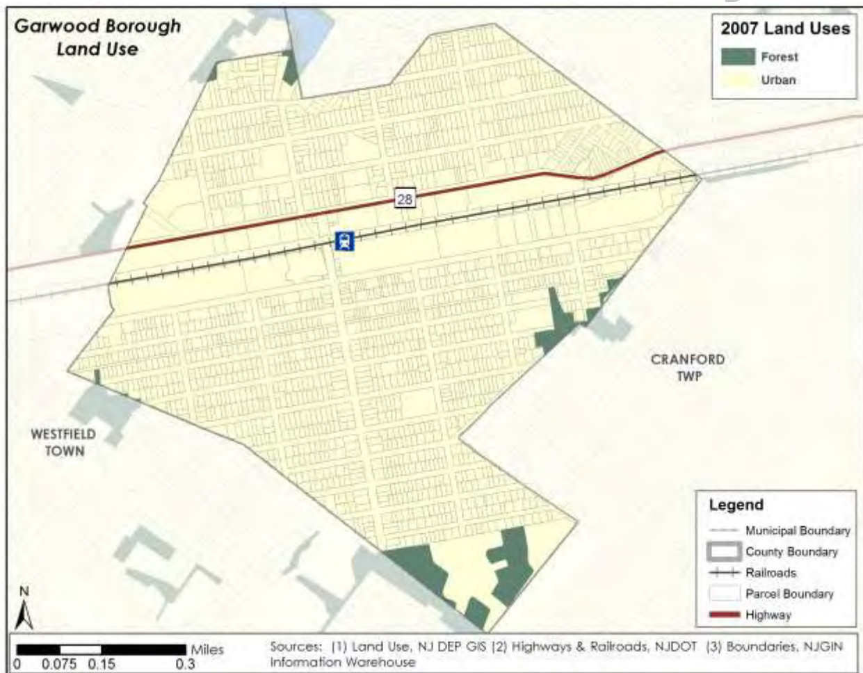
Figure 5-1 Land Use/Land Cover Map Borough of Garwood