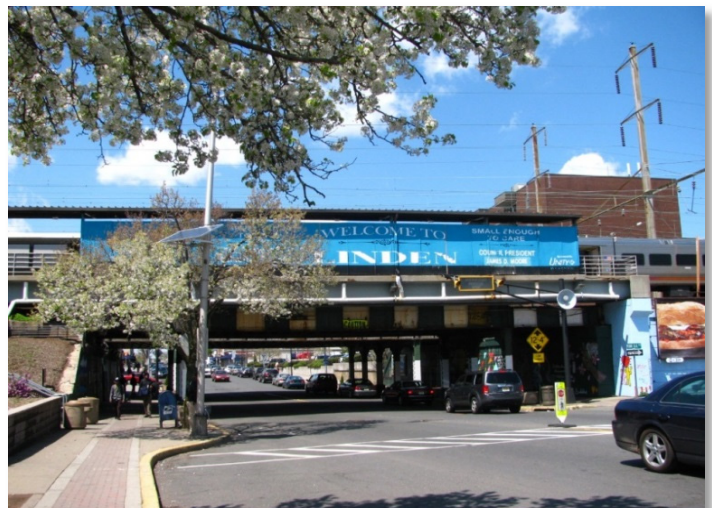
Downtown Linden and train station.

Linden is home to the small, regional Linden Airport and is near Newark Liberty International Airport. The city is traversed by the New Jersey Turnpike, as well as U.S. Route 1-9 and Route 27. The Garden State Parkway runs just west of the city. The Northeast Corridor Rail Line runs through Linden, with the Linden train station located downtown. The City is also served by NJ Transit bus lines 48, 56, 57, 94, 112, and 115. Linden was designated a Transit Village in 2010 by the NJ Department of Transportation and was awarded a large grant for transit-related development in 2013. 84.7%