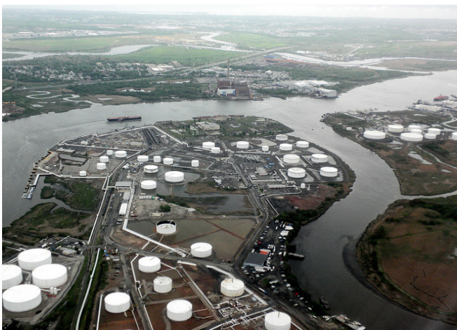
Tremley Point, Arthur Kill and Rahway River.