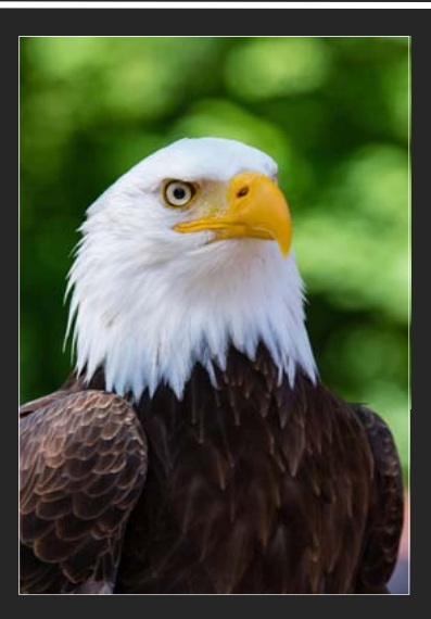
Eagle Cam Teacher Training Workshop Thursday, March 7