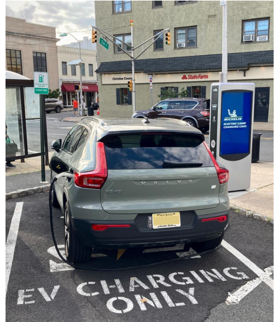
Westfield Train Station