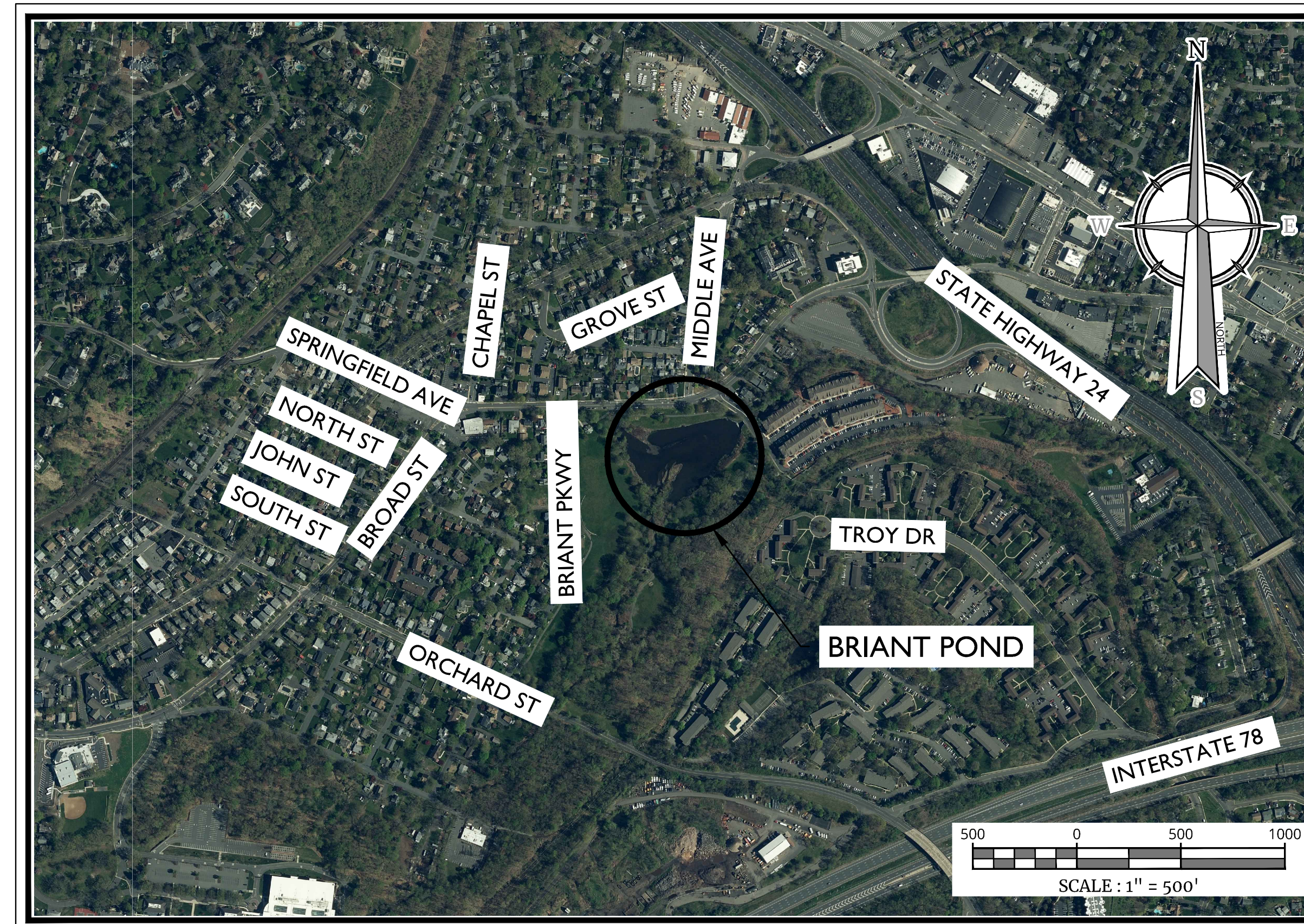
BRIANT POND LOCATION MAP