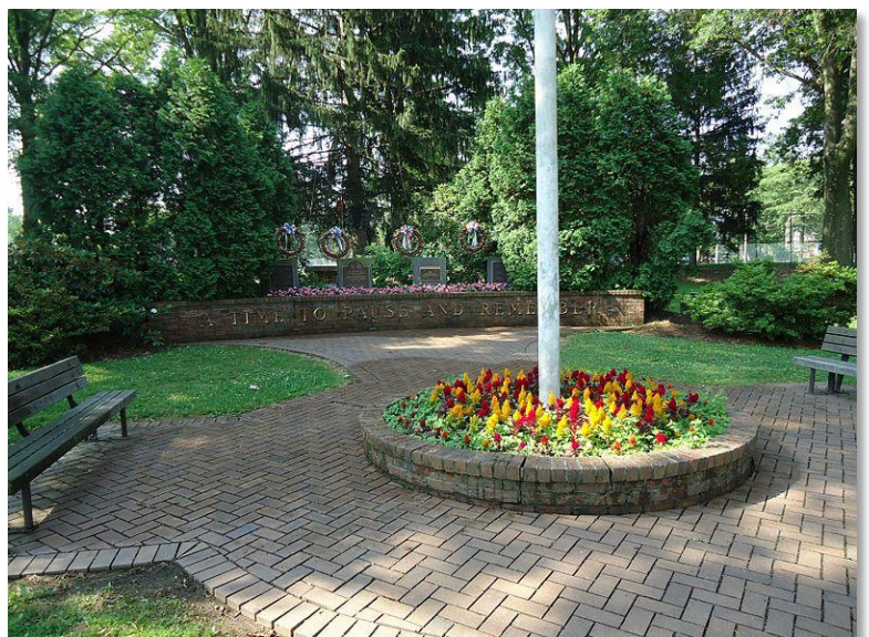
Memorial Park near the train station.