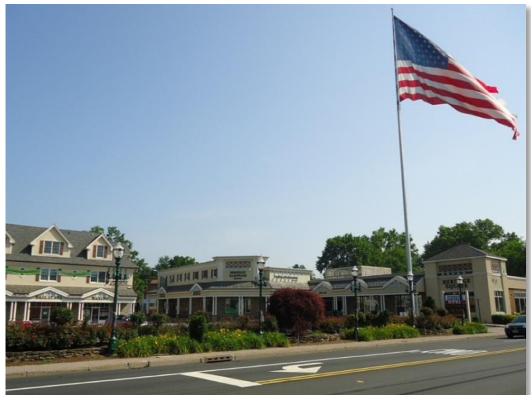
Above: Downtown shopping center.

Route 78, which runs along the southeastern border, is the only major arterial in Berkeley Heights and has many major corporations along it. County and local roads provide access throughout the municipality. Berkeley Heights is served by the Gladstone Branch of the Morris & Essex Rail Line via Berkeley Heights Station located on