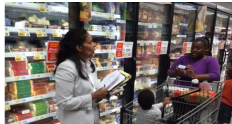
SUPERMARKET TOURS TEACH LABEL READING