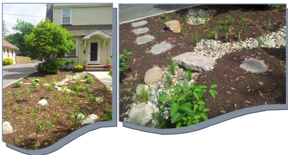
A rain garden in the front yard of a home in Rahway- custom designed to look like a rocky stream bed.

For the last 5 years, projects have been installed in the City of Rahway and Township of Clark to help reduce rainwater runoff, flooding, and protect the water quality of the Robinson's Branch stream, a tributary of the Rahway River. This past June marked the end of this project that saw 18 rain gardens, 2 pervious pavement projects, and one green car wash installed (complete with a rainwater harvesting cistern). These types of "green infrastructure" projects are environmentally friendly, sustainable, and cheaper than traditional "grey infrastructure" practices that use gutters, basins, and pipes to transport polluted stormwater to local streams, rivers, and lakes.