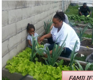
FAMILIES FROM MADISON HOUSE GARDEN TOGETHER

Shaping Elizabeth Funders include: Shaping NJ – NJ Department of Health, Elizabethtown Health Foundation, •Together North Jersey, American Heart Association, Alan M. Voorhees Transportation Center, Rutgers.