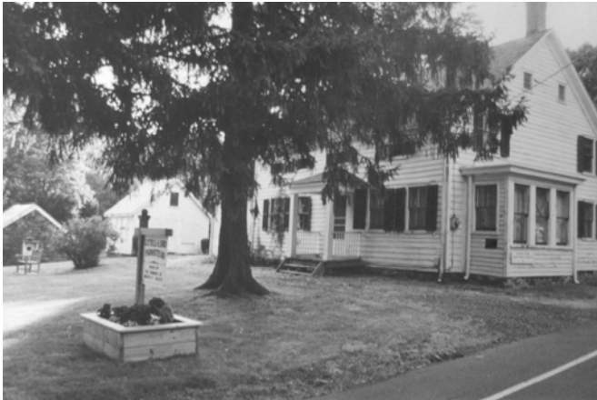
LITTELL-LORD FARMSTEAD National and State Registers of Historic Places 31 Horseshoe Road Berkeley Heights, NJ 07922 908-219-4715