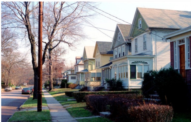
A street in Roselle.