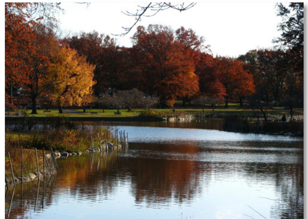
Warinanco Park in Roselle.

Roselle is bordered to the north by Route 28 and to the south by Route 27, both major commercial arteries connecting it to other destinations in Union County and the State. The NJ Transit Raritan Valley Line runs just north of Roselle and the station in Roselle Park is easily accessible. Additionally, the Northeast Corridor Line runs