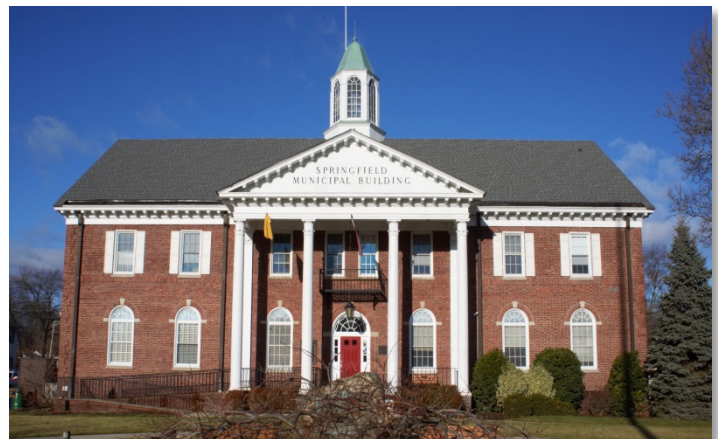
Springfield Municipal Building.

Interstate 78 runs through the northern part of Springfield and Route 22 runs through the southern part. Although the township does not have a train station, residents are currently served by stations in neighboring communities of Summit and Union. The township is also served by NJ Transit bus routes 52, 65, 66, 70, 95, 114 and 117. For workers in Springfield Township, 83.1% commute by private automobile, and 10.9% use public transportation. Nearly 50% worked outside of Union County and 14% worked outside of New Jersey. The average commute time for a worker from Springfield is 32.1 minutes.