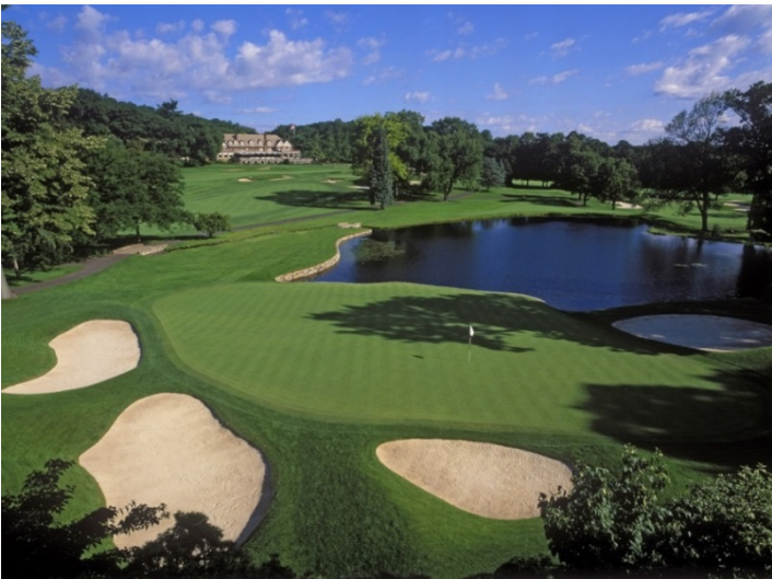
Baltusrol Golf Course.