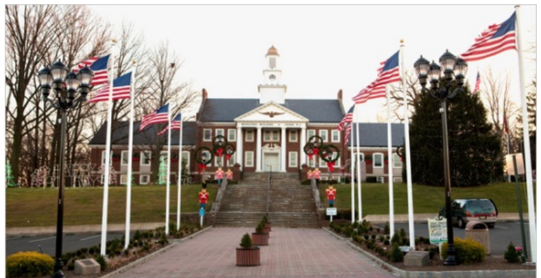
Union Municipal Building.

The Township of Union is traversed by a network of local and regional roadways including the Garden State Parkway, Interstate 78, U.S. Route 22, and State Route 82 (Morris Avenue). The Township is also located only minutes away from Newark Liberty International Airport. Union is only a short train ride to New York City on the Raritan Valley Line, with a