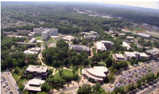
Kean University Campus.