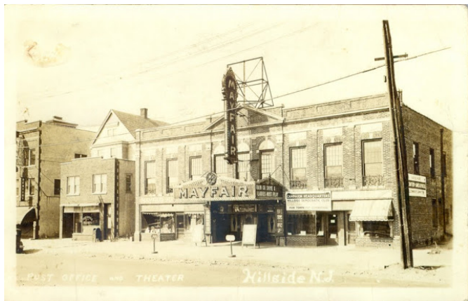
Historic Mayfair Theater.