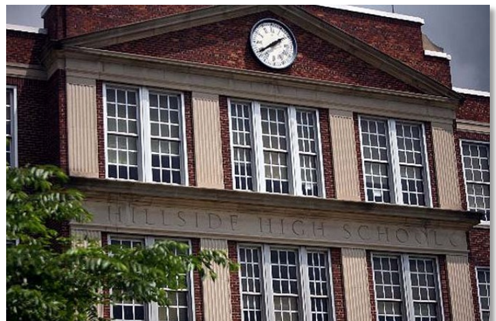
Hillside High School.

Route 22 is the major arterial running through Hillside, providing access to the rest of Union County and the state. Interstate 78 and the Garden State Parkway also run through the northwest portion of the Township. Although the Township does not have a train station within its borders, it is close to the NJ Transit Raritan Valley Line station in Union and the Northeast Corridor Line stations in Elizabeth. Hillside is served by NJ Transit bus lines 26, 59, 65, 66, 99, 113 and 114. Hillside is also close to Newark Liberty International Airport and the seaports of Newark and Elizabeth. Approximately 78.4% of working Hillside