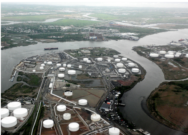
Tremley Point, Arthur Kill and Rahway River.