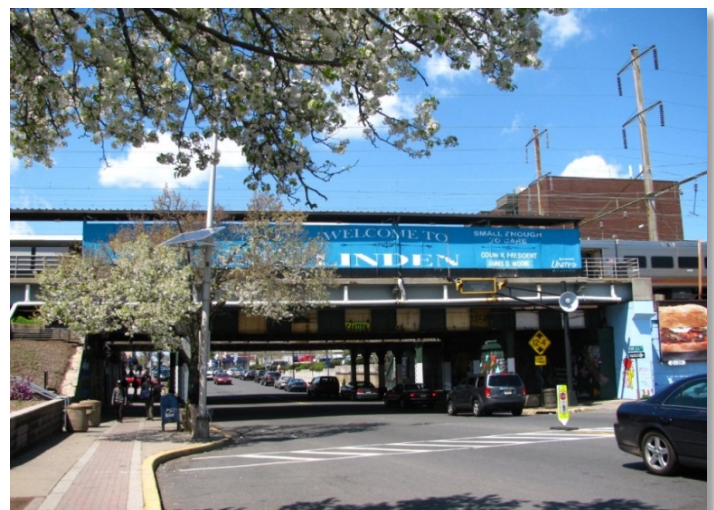
Downtown Linden and train station.

Linden is home to the small, regional Linden Airport and is near Newark Liberty International Airport. The city is traversed by the New Jersey Turnpike, as well as U.S. Route 1-9 and Route 27. The Garden State Parkway runs just west of the city. The Northeast Corridor Rail Line runs through Linden, with the Linden train station located downtown. The City is also served by NJ Transit bus lines 48, 56, 57, 94, 112, and 115. Linden was designated a Transit Village in 2010 by the NJ Department of Transportation and was awarded a large grant for transit-related development in 2013.