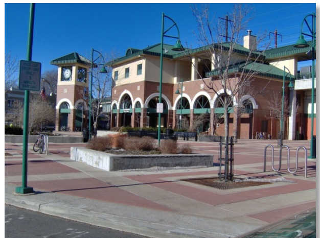
Rahway Train Station.

Rahway was an early recipient of NJ Department of Transportation's Transit Village designation program in 2002. The City is traversed by the Northeast Corridor Rail Line, which provides direct access to New York City and Trenton, and the North Jersey Coast Rail Line, with a station in downtown Rahway.