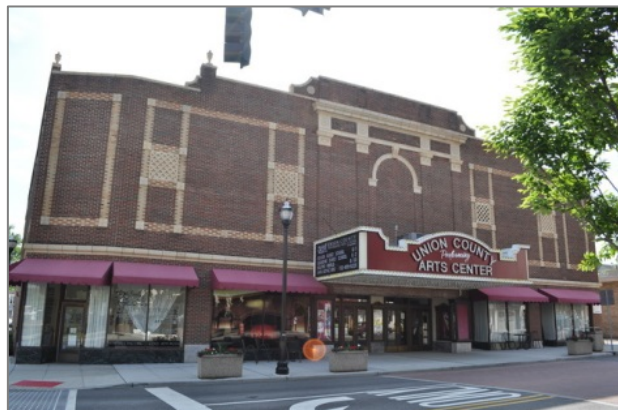
Union County Performing Arts Center.