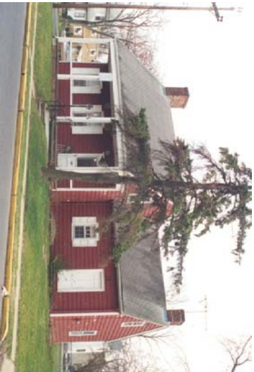
Abraham Clark Memorial House