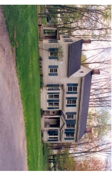
Deacon Andrew Hetfield House