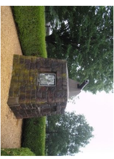
Ash Brook Reservation