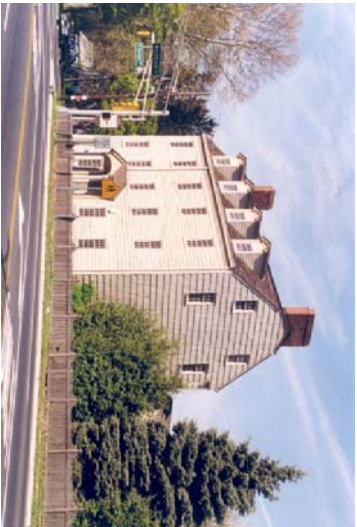
Merchants and Drovers Tavern