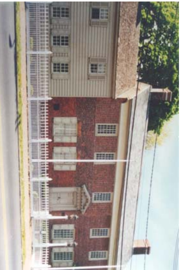
Nathaniel Bonnell Homestead & Belcher-Ogden Mansion