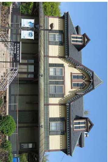
Historic Fanwood Train Station