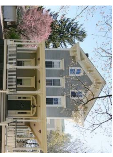
Reeve History & Cultural Resource Center