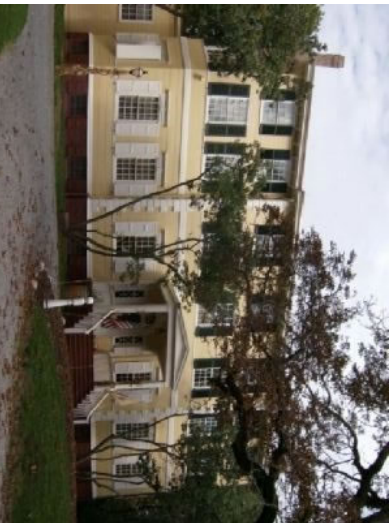
Liberty Hall Museum