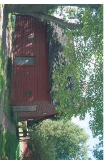
Dr. William Robinson Plantation