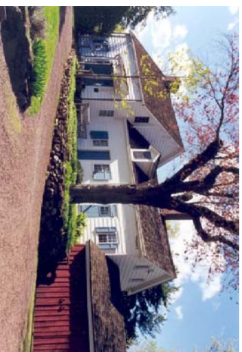
Miller-Cory House Museum