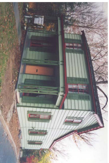
Crane-Philips House Museum