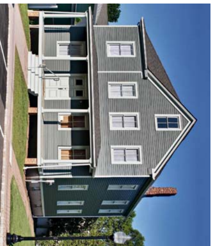
Oswald J. Nitschke House