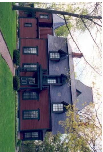
Drake House Museum