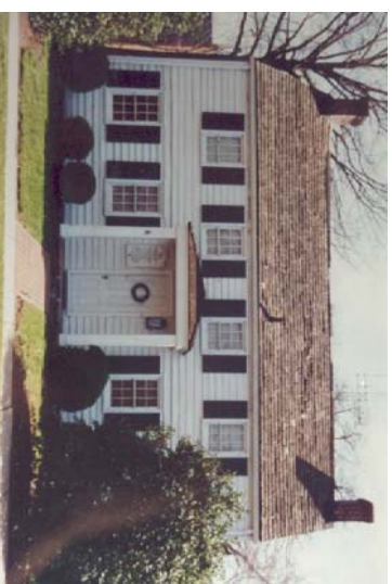
Osborn Cannonball House