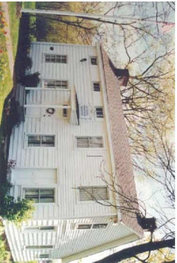
Salt Box Museum