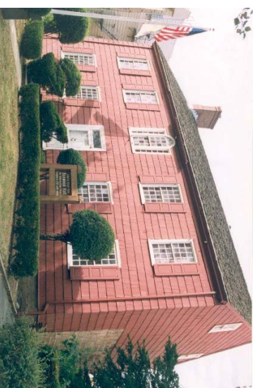
Boxwood Hall State Historic Site