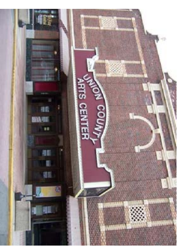
Union County Performing Arts Center