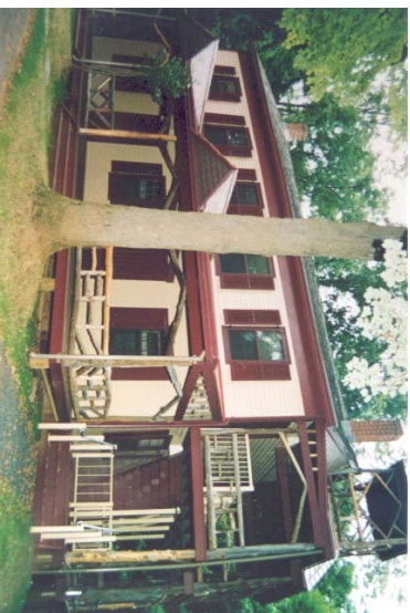
Deserted Village of Feltville-Glenside Park

More Images are available at www.ucnj.org/4C