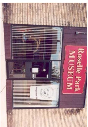
Roselle Park Museum