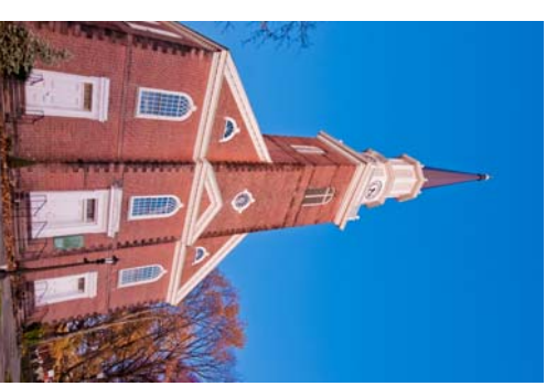
First Presbyterian Church of Elizabeth