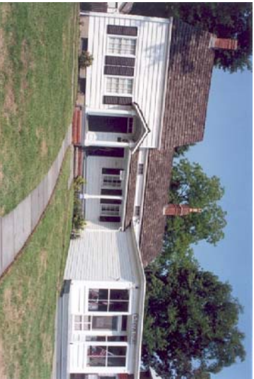
Woodruff House Eaton Store Museum