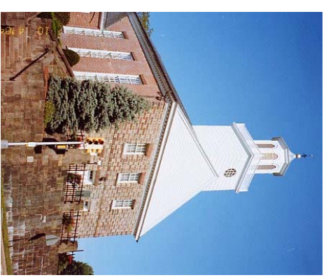
The Connecticut Farms Church