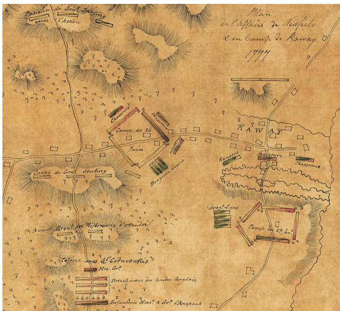
Portion of a map drawn by a Hessian officer, showing battle positions