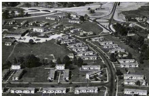
Aerial view of Winfield in 1952

At just .17 square miles, Winfield is the smallest Union County municipality. In 1940, Congress allocated funds for construction of federal housing developments for workers employed in war-related activities. A tract of land along the Rahway River was purchased for such a development. Early residents of Winfield were families of members of Union Local No. 16 of the Kearny Shipyards.