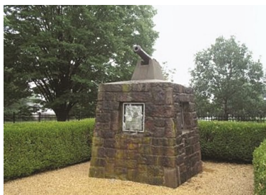
Battle of the Short Hills Monument at the entrance to Ash Brook Golf Course