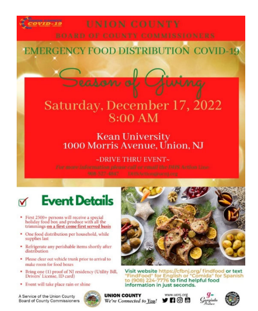
Images of advertisements for the County's Food Distribution and Vaccination programs.

The County also issued a survey made available to all residents of the County for input as to the use of SLFRF. The purpose of the survey was to gauge the County's residents' strongest needs as a result of the impact of the COVID-19 pandemic. The survey was made available on the County website and via paper copies. It was available in English, Spanish, and Portuguese. The County has reviewed and considered the responses to the survey in developing a plan of action to best address the community's needs.