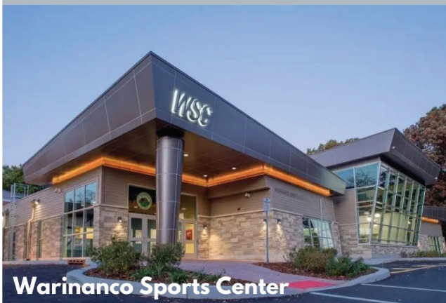
Warinanco Sports Center