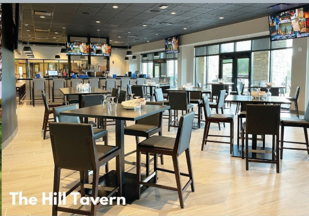
The Hill Tavern