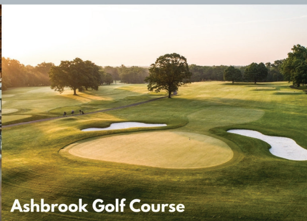
Ashbrook Golf Course