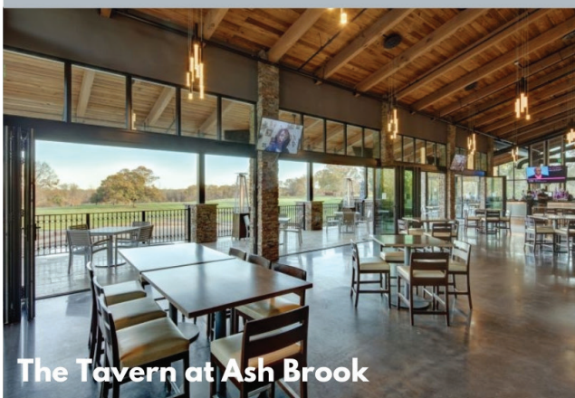
The Tavern at Ash Brook