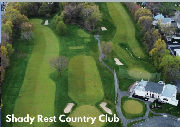
Shady Rest Country Club