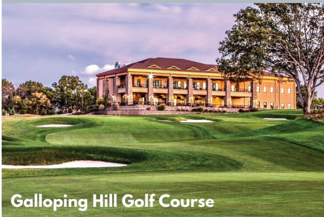
Galloping Hill Golf Course