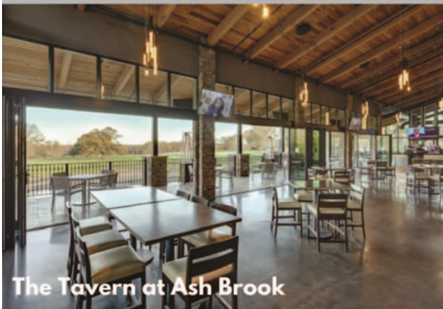
The Tavern at Ash Brook