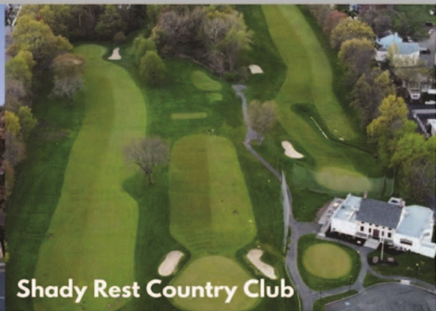
Shady Rest Country Club