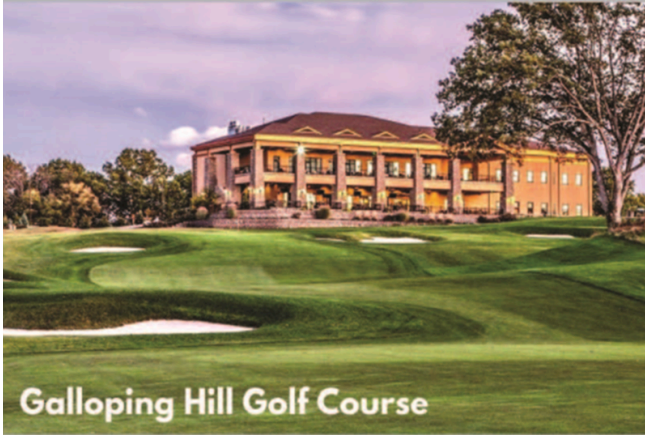
Galloping Hill Golf Course