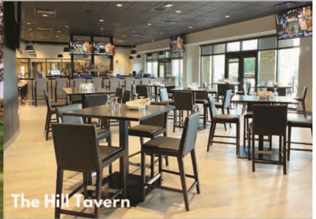
The Hill Tavern