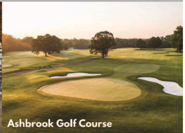
Ashbrook Golf Course