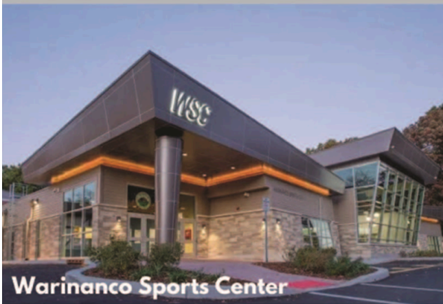
Warinanco Sports Center